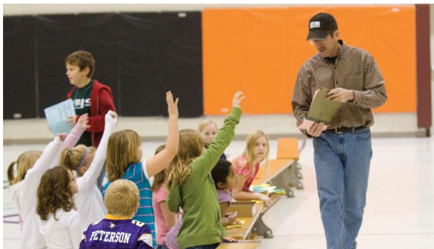
Olwell regularly has two or three classes of students at once in order to ensure all North Trail students have physical education every day.

Olwell will speak at the Central District American Association of Health,