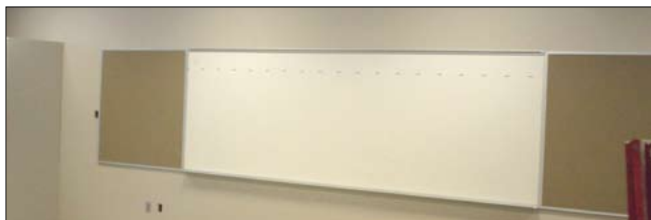
Finishing touches are being installed in many places throughout the new Farmington High School. Cabinets and other fixtures are in place in the school's hands-on science labs (top right). Student lockers are in place (right) and many classrooms have whiteboards installed (above)